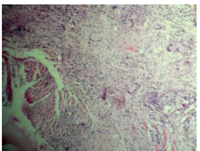
Photomicrograph 1 – Tuberculous Granuloma with Muscle Tissue of Tongue (Low Power View H & E Stain)